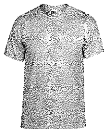
Pink/ AZALEA BASIC SHORT SLEEVE T-SHIRT